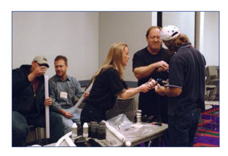
The first CMT contractor training course, conducted at the NGWA Expo in Las Vegas, December 2004. Contractors are being instructed on proper port construction.