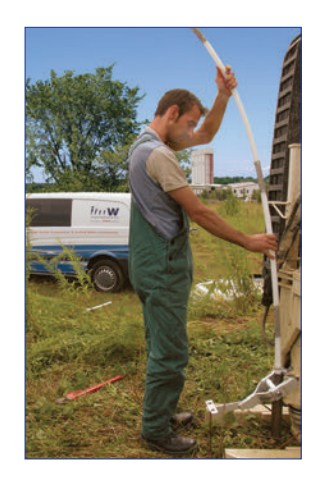
3-Channel CMT installation at a plant in Zeitz, Germany. Systems were completed using natural collapse and are being used to assess natural attenuation of BTEX.