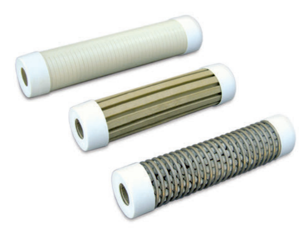
3-channel CMT Sand and Bentonite Cartridges

The CMT can be installed using standard sand and bentonite layers placed via a tremie pipe, or poured directly from the surface. The Model 103 Tag Line is ideal for accurate placement of sand and bentonite during borehole completion. If the installation is in loose sands, natural collapse can be used, allowing the sand to collapse around the tubing.