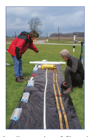
Installation of a 3-Channel CMT System with bentonite and sand cartridges. Three zones were monitored over a 20 ft (6 m) depth. The installation was completed in glacial till at the University of Waterloo, Ontario Canada.