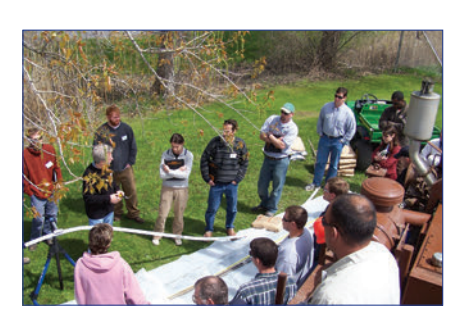
Outdoor installation/ demonstration at premises of Parrat-Wolff, Environmental and Geotechnical Drilling Services, Syracuse, New York.