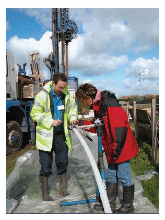
Construction of CMT ports in a 7-Channel system installed in Silsoe, England.

Two systems are available. The 1.7" (43 mm) OD polyethylene tubing, segmented into seven channels, allows groundwater monitoring at up to 7 depth-discrete zones. The 3-Channel System uses the same material and construction, but it is only 1.1" (28 mm) in diameter. This narrow tube was developed for smaller diameter installations, especially direct push where the annulus for seal placement is narrow.