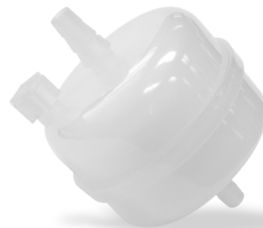
Model 860 Disposable Filter