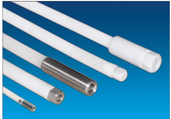
From left to right: Mini Inertial Pump, SS16, SS19, D16, and D25 Inertial Pumps