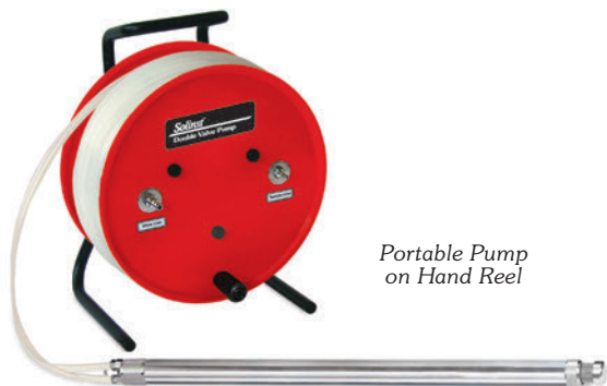
Portable Pump on Hand Reel

For less frequent sampling, reel mounted portable systems allow access to multiple monitoring wells, even in remote locations. The reel mounted portable units are free-standing with a convenient carrying handle. They can be made for almost any size or depth of application.