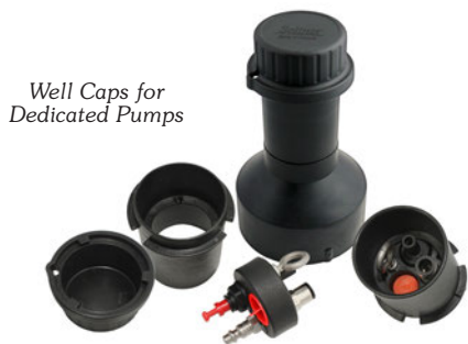
Well Caps for Dedicated Pumps

The DVP is suitable for low flow or regular flow sampling. The stainless steel pumps can operate to depths of 500 ft (150 m).