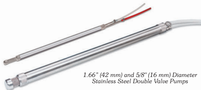
1.66" (42 mm) and 5/8" (16 mm) Diameter Stainless Steel Double Valve Pumps