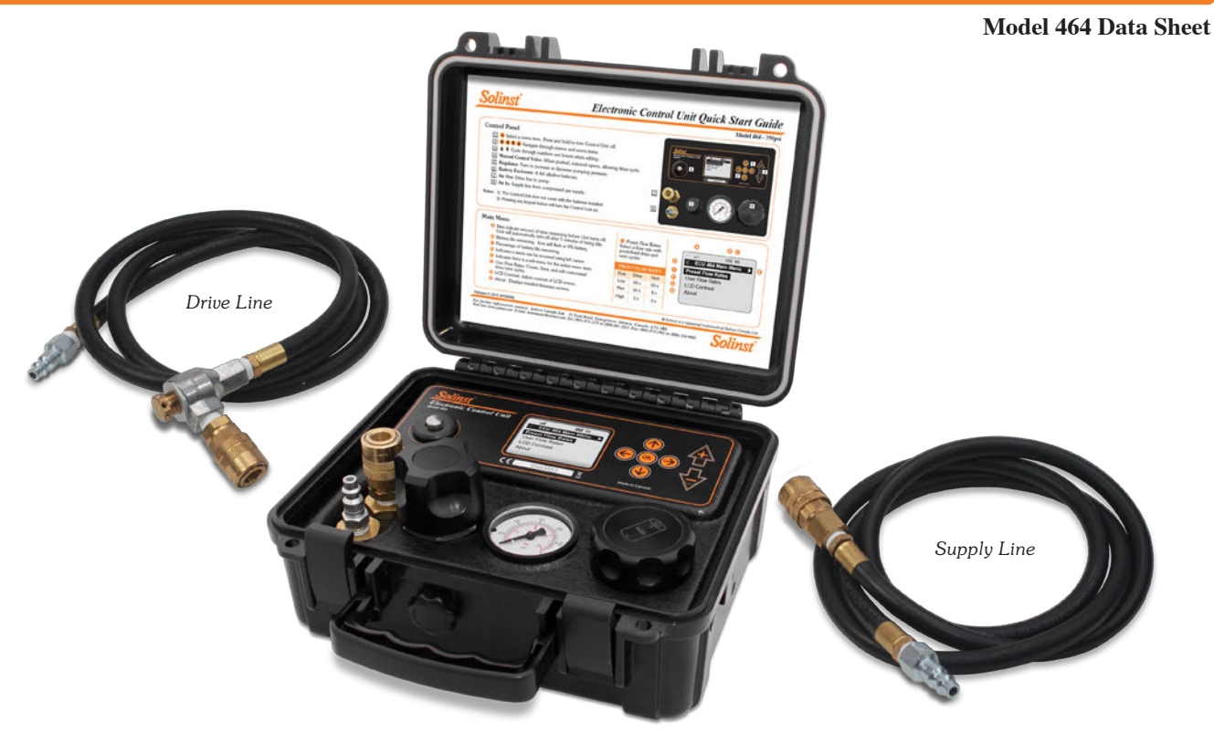
464 Electronic Pump Control Unit