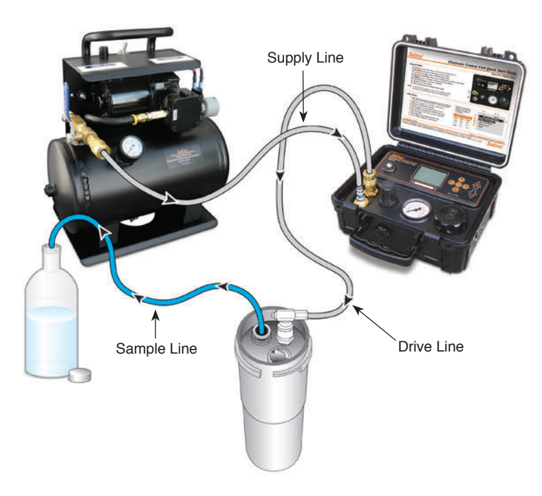
Pumping Setup with 125 psi Model 464 Electronic Pump Control Unit and 12 Volt Compressor