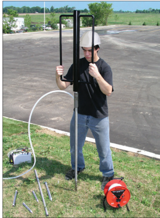
Installing Piezometers with a Manual Slide Hammer

Solinst Drive-Point Piezometers can be driven into the ground with any direct push or drilling technology, including the Manual Slide Hammer shown at right. To avoid clogging or smearing of the screen during installation, a shielded version is also available.