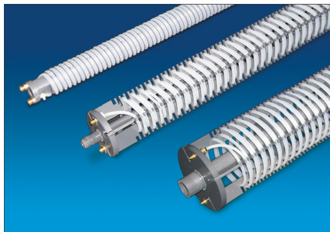
1.8", 3.8" & 5.8" Waterloo Emitters