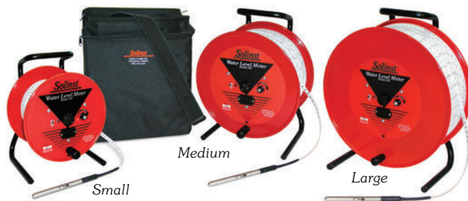
Model 101 Water Level Meter Reels

* Polyethylene tapes are only available in these lengths