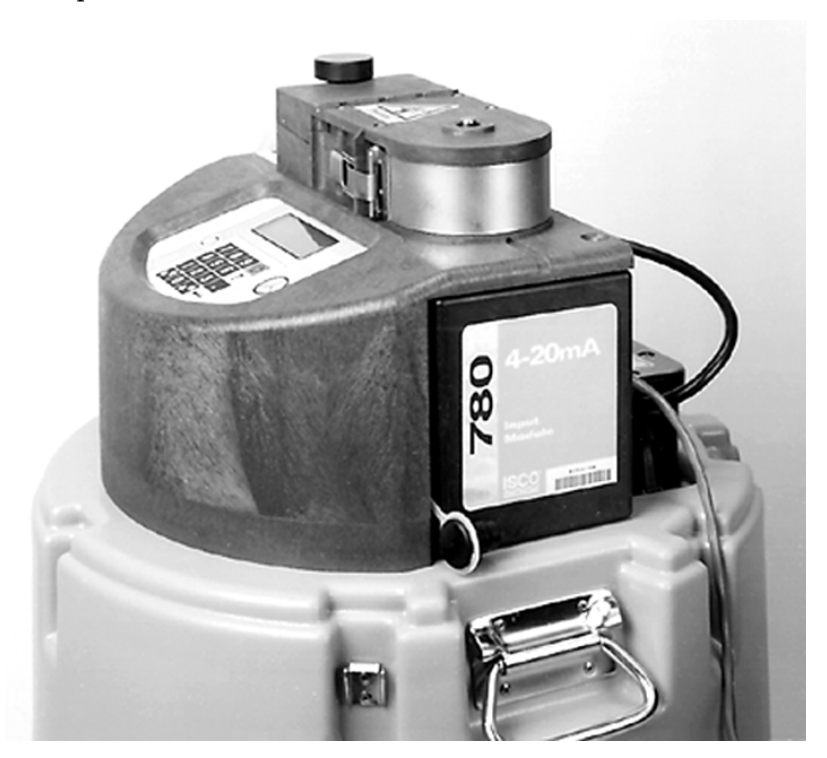
Figure 1-1 780 Module Installed on a Sampler

The 780 module can only be used with 6700 Series samplers. The module receives a 4 to 20 mA analog signal from a non-Isco instrument and transmits it to the sampler. The 4 to 20 mA analog signal is an industrial standard current loop for process control equipment. In the sampler, the current range of 4 to 20 mA represents percentage, with 4 mA equivalent to 0% and 20 mA equivalent to 100%.