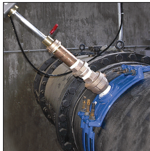
The ADFM Hot Tap sensor installs through a standard two-inch tap.