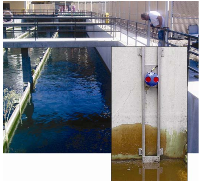
H-ADFM is well suited for monitoring flow in wide channels such as chlorine contact basins. Inset shows sensor mounting on vertical wall of basin.