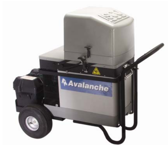
Optional mobility kit includes pneumatic tires for ease of transport over rough terrain, and a convenient battery platform.