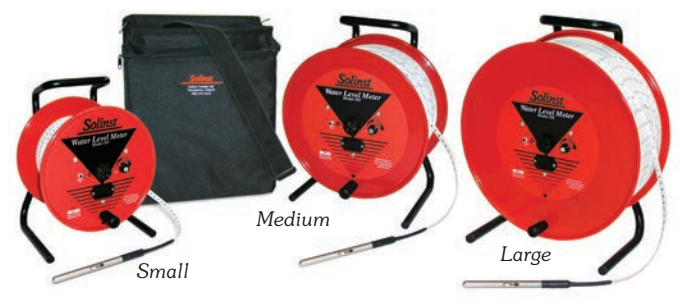
Model 101 Water Level Meter Reels

* Polyethylene tapes are only available in these lengths