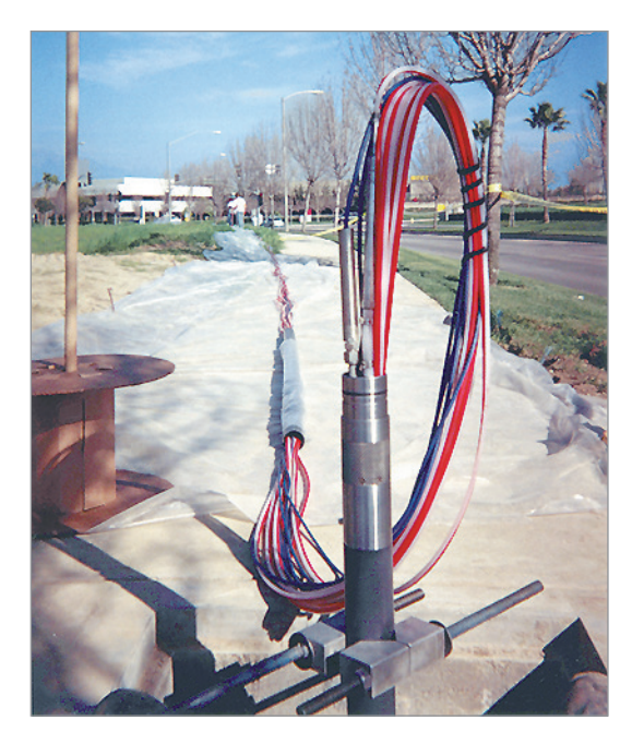
Contaminant investigation at a U.S. Air Force Base. Waterloo Systems installed to 700 ft. in overburden using screened and cased wells. Up to 6 zones per hole with dedicated pumps and transducers.