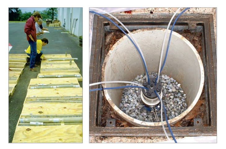
Using core logs to identify placement of Ports and Packers (left). Multi-Purge Manifold with transducers and dedicated pumps for four zone monitoring (right).