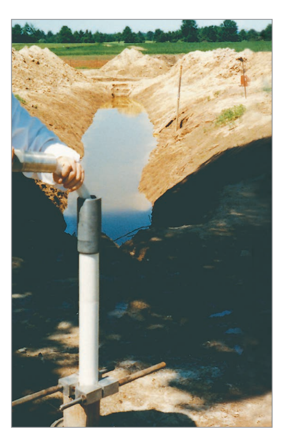
Underground oil pipeline leak assessment. Three 150 ft. (45 m) installations. Two point rising head permeability tests were conducted in each interval of the Multilevel System. (See diagram showing contaminant distribution at left.)