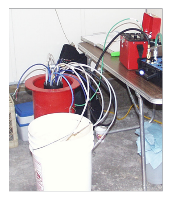
Four Waterloo Systems were installed to monitor a chlorinated compound release. Systems were installed at depths ranging from 430 ft - 750 ft, with most monitoring 7 zones. The Ports were constructed with both Double Valve Pumps and Vibrating Wire Transducers.