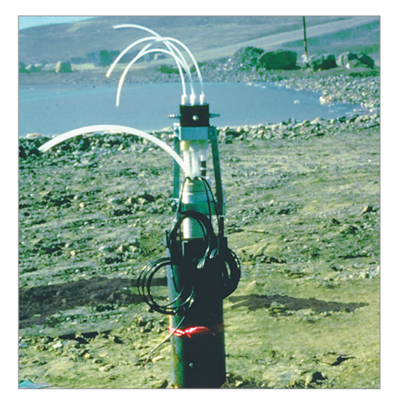
Landfill site over fractured granite, monitored with five Waterloo Systems. Each System comprised of dedicated Double Valve Pumps and Pressure Transducers in 4-6 intervals to depths of 275 feet (84 m). The Multi-Purge Manifold allowed the monitoring of 21 zones to be completed in less than 2 days.