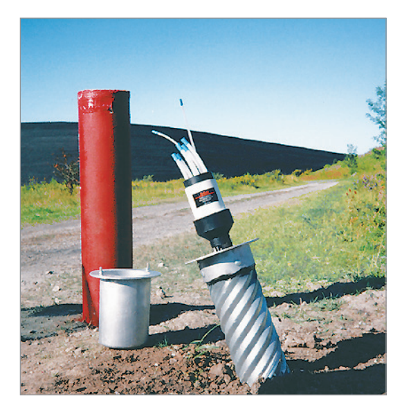
An investigation of hydraulic properties beneath a large waste site. Waterloo Multilevel Systems were chosen to allow water quality sampling and to help determine the zones of highest permeability within the aquifer.