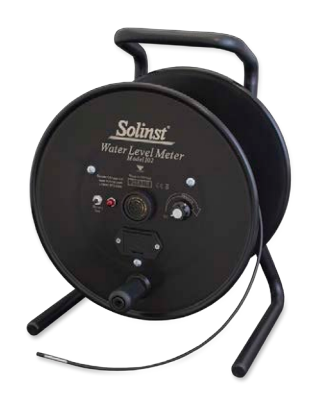
Model 102 P4 Water Level Meter

Sampling may be performed in open tubes using a Mini Inertial Pump, Micro Double Valve Pump, or a Peristaltic Pump.