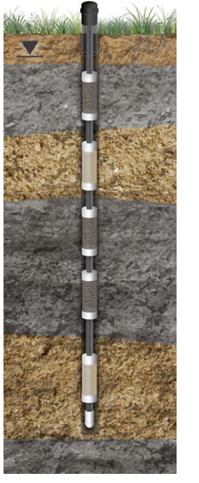
Typical 3-Channel CMT Installation in Overburden with Bentonite and Sand Cartridges

A multilevel well that uses a continuous length of multichannel tubing has the advantage over other multilevels in that there are no joints. This significantly reduces the time and cost of installing wells and at the same time increases the reliability of the system. The CMT is very simple and convenient to use, as it gives full flexibility as to where monitoring zones are located.