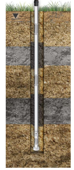
Typical 3 or 7-Channel CMT Installation using Layers of Bentonite and Sand Backfilled from Surface

The number and location of ports may be determined in advance, or after drilling the borehole. A Port Cutting Guide is used to create a port in a given channel, at the specified depth to be monitored. A plug is positioned and sealed in the channel just below the port opening and a stainless steel screen is fixed in place over the port to prevent fines from entering. Each channel is also sealed at the bottom of the tubing to avoid cross communication between monitoring zones.