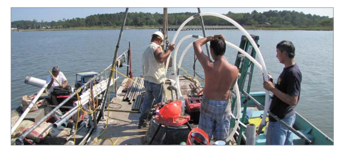
CMT Systems were installed at the bottom of a bay to measure submarine groundwater discharge. Eight 7-Channel CMT Systems were installed, with custom modifications to suit the open water application. Watertight wellheads had to be custom built to allow for sampling from the surface of the bay using a peristaltic pump.