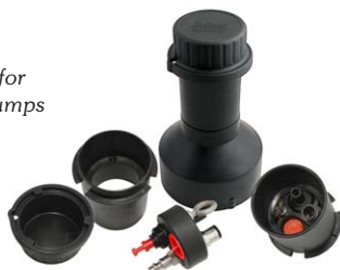
Well Caps for Dedicated Pumps

The caps slip easily onto 2" dia. (50 mm) wells. Adaptors to fit 4" dia. (100 mm) wells are also available. They have quick-connect fittings for the drive and sample tubing.