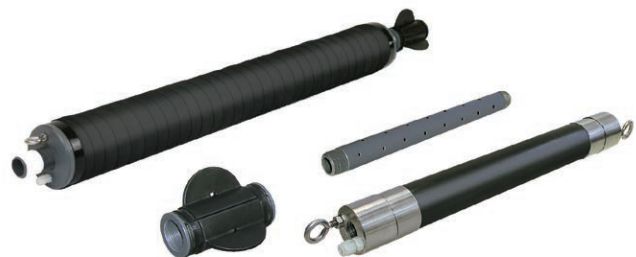
Model 800 Packers 3.9" and 1.8" (99 mm and 46 mm)

Model 800 Low-Pressure Packers can be used with Solinst Bladder Pumps to minimize purge times by reducing purge volumes. This reduces the cost of water disposal and labour. Packers are available in single point or straddle packer designs, and in sizes to fit 2" (50 mm) to 5" (127 mm) dia. wells. (See Model 800 Data Sheet.)