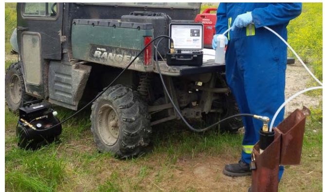
Sampling with a Dedicated Bladder Pump using Portable, Rugged, Easy-to-use, Compressor and Controller

For water level monitoring there is an access hole to fit a Solinst Model 101 Water Level Meter or Levelogger. An eyebolt is provided for a pump support cable or for suspension of a Solinst Levelogger, (see Model 3001 Data Sheet) or other device.