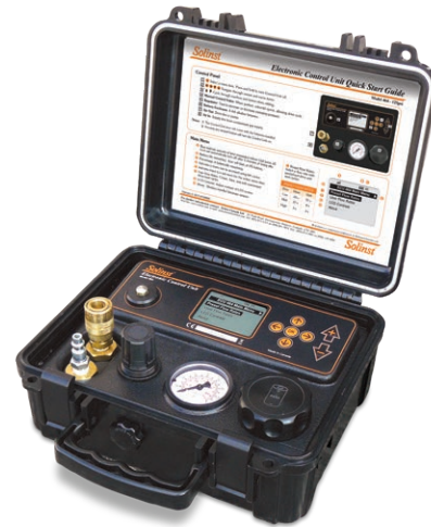
Model 464 Electronic Control Unit (125 psi and 250 psi Models)

These convenient Controllers are rugged, dependable and suitable for all environments. Quick-connect fittings allow instant attachment to dedicated well caps, portable reel units and to an air compressor or compressed gas source.