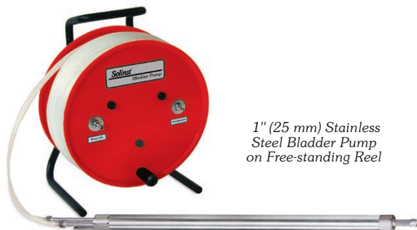
1" (25 mm) Stainless Steel Bladder Pump on Free-standing Reel

They are supplied on a free-standing reel. The rugged systems are very convenient and easy to transport. Tubing fittings on the reels and controller are compression fittings, allowing quick set up in the field. The Solinst Model 103 Tag Line can be used to lower and support the pump in the well (see Model 103 Data Sheet).