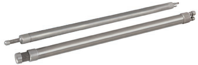
Solinst Bladder Pumps available in Stainless Steel 1" and 1.66" (25 mm and 42 mm).