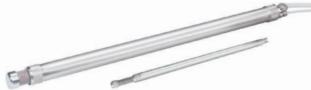
1.66" (42 mm) and 5/8" (16 mm) Diameter Stainless Steel Double Valve Pumps

The DVP is suitable for low flow or regular flow sampling. The stainless steel pumps can operate to depths of 500 ft (150 m).