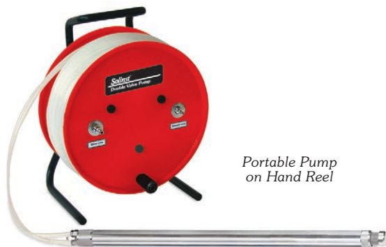
Portable Pump on Hand Reel

For less frequent sampling, reel mounted portable systems allow access to multiple monitoring wells, even in remote locations. The reel mounted portable units are free-standing with a convenient carrying handle. They can be made for almost any size or depth of application.