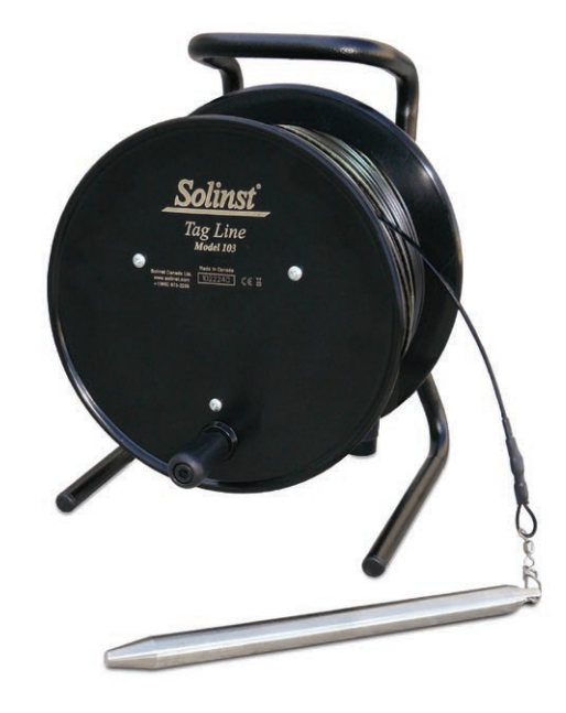
Tag Line / Suspension Cable