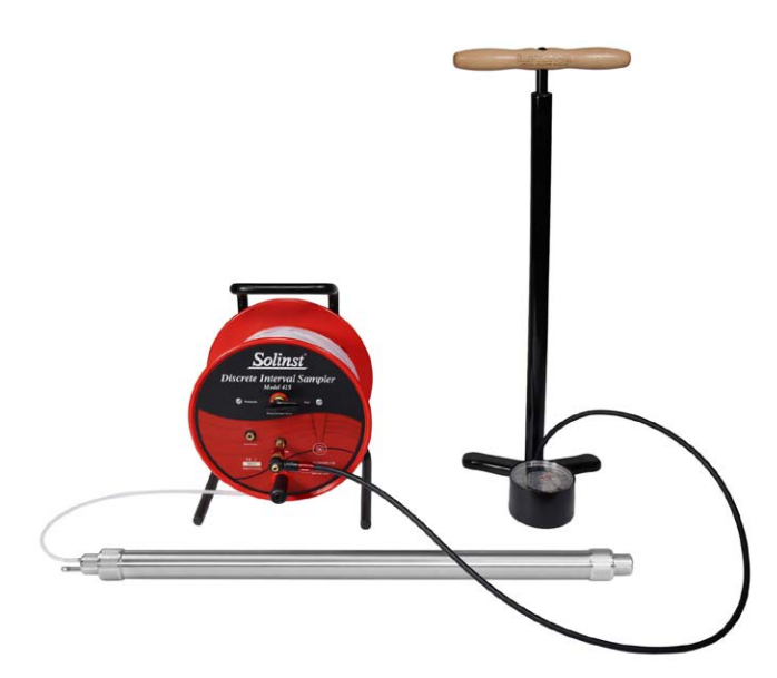
1.66"ø Discrete Interval Sampler with High Pressure Hand Pump