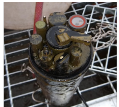
Above: A Proteus withdrawn from a PST tank showing the success of the wiper in maintaining a clear optical window for the TLF sensor!