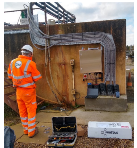
Right: An example from Severn Trent Water of a Proteus being installed into their existing telemetry system, to provide real-time BOD at one of their WWTWs.