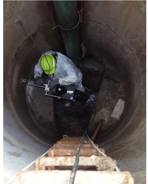
Flow Meter technician in the pipe adjusting the LaserFlow

It was decided the slope setting would be changed. After determining the slope of the pipe from a 12 foot rise over a 150 foot run = 8% slope. After a few program adjustments, the sensor worked flawlessly.