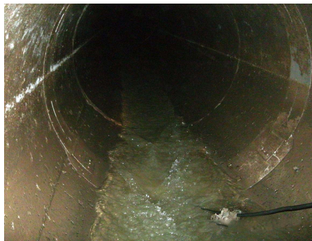
View of flow inside the pipe

This site, in a sanitary sewer, had two options for flow monitoring applications. The first application was in front of an overflow bypass gate where standard area velocity flow monitoring technologies were installed and working, but only intermittently. When the gate closed, the water surcharged the pipe until it overflowed into the bypass weir. The AV sensor was no longer able to read the bypass flow because the water at the bottom of the channel was no longer flowing. Another challenge was with the pipe joints creating turbulence.