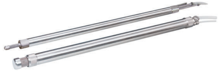
Solinst Bladder Pumps available in Stainless Steel 1" and 1.66" (25 mm and 42 mm).