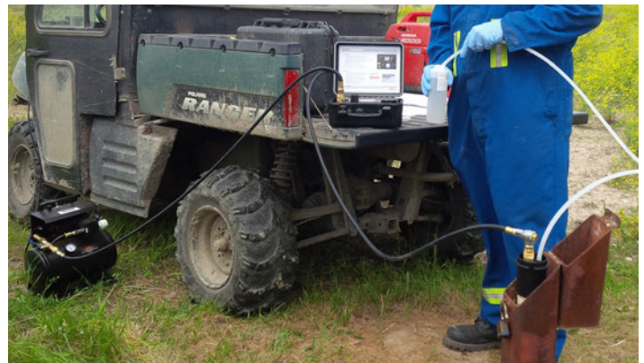
Sampling with a Dedicated Bladder Pump using Portable, Rugged, Easy-to-use, Compressor and Controller

For water level monitoring there is an access hole to fit a Solinst Model 101 Water Level Meter or Levelogger. An eyebolt is provided for a pump support cable or for suspension of a Solinst Levelogger, (see Model 3001 Data Sheet) or other device.