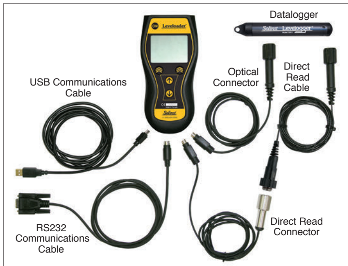
Leveloader Gold Connections