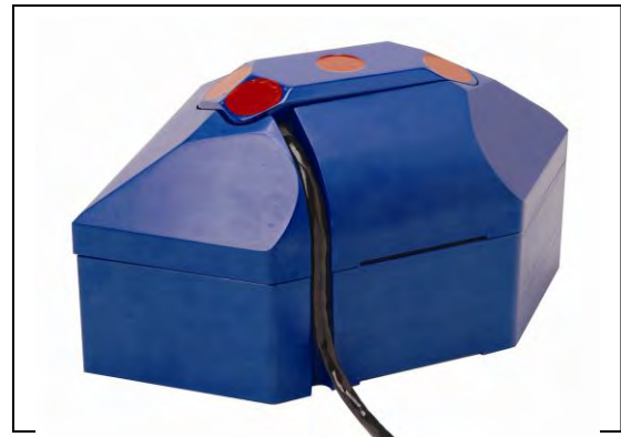
An optional sensor fairing and selection of spacers in varying heights are available to raise the sensor higher within the flow stream. Mounting rings and an assortment of sensor wire clamps are also available.