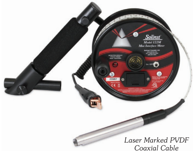
Laser Marked PVDF Coaxial Cable

Model 122 is approved for use in hazardous locations Class I, Div 1, Groups C&D based on CSA Standards and is ATEX certified under directive 94/9/EC as II 3 G Ex ic IIB T4 Gc