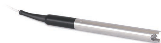
Model 122M P8 Probe

The 122M uses the P8 Probe, which is 16 mm (5/8") in diameter and stainless steel. It is pressure proof, up to 500 psi. The beam is emitted from within a Hydex cone-shaped tip. The tip is protected by an integral stainless steel shield, and is excellent for the vast majority of product monitoring situations. A cleaning brush is included with each Meter.