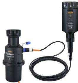
AquaVent Wellhead and App Connector Cable