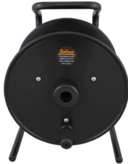
3001 SC1000 MKII Direct Read Cable Reel (#109752)