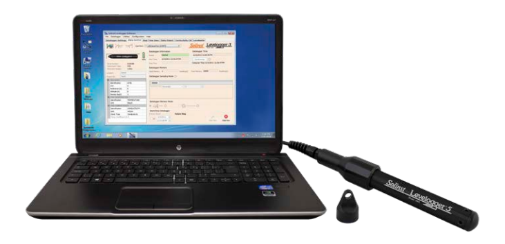
Fast communication and downloading speeds with a high speed Field Reader 5

The Levelogger 5 uses a Faraday cage design, which protects against power surges or electrical spikes caused by lightning. Its durable maintenance-free design, high accuracy and stability, make the Levelogger 5 the most reliable instrument for long-term, continuous water level recording.