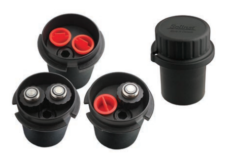
Levelogger 2" Locking Well Cap Installations (see Well Caps data sheet for more details)

The cap is vented to equalize atmospheric pressure in the well. It slips over the casing, and can be secured using a lock with a 9.5 mm (3/8'') shackle diameter.