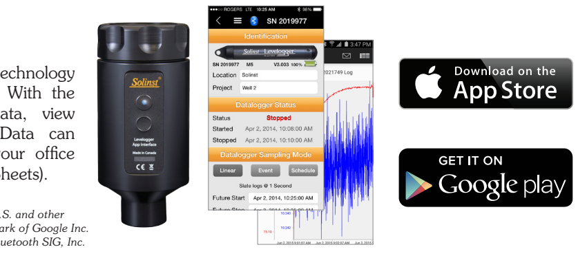
High Quality Groundwater and Surface Water Monitoring Instrumentation

A firmware upgrade will be available from time to time to allow upgrading of the AquaVent, as new features are added.