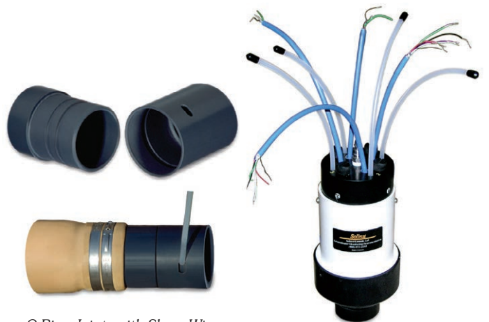
O-Ring Joints with Shear Wire

The slip-on joint design of the Waterloo System uses a nylon shear wire and an o-ring. This gives reliable, leakproof joints so that the core of the Waterloo casing string is isolated from external formation waters. Groundwater is only accessible via the port stems and attached monitoring equipment. This water-tight seal also prevents contact between packer inflation water inside the casing and the formation water outside the casing.