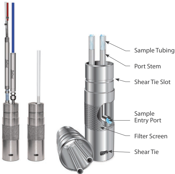
Stainless Steel Ports