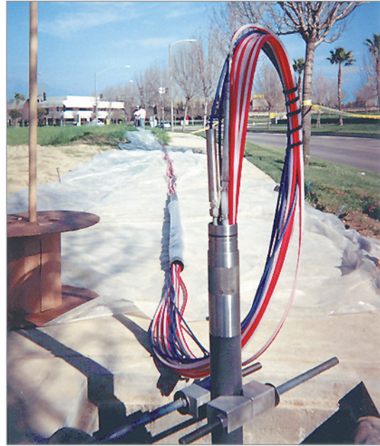
Contaminant investigation at a U.S. Air Force Base. Waterloo Systems installed to 700 ft. in overburden using screened and cased wells. Up to 6 zones per hole with dedicated pumps and transducers.