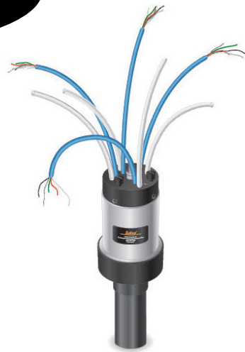
Multi-Purge Manifold Wellhead