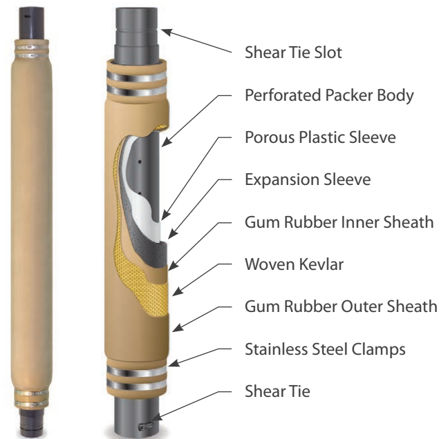
Permanent Waterloo Packer