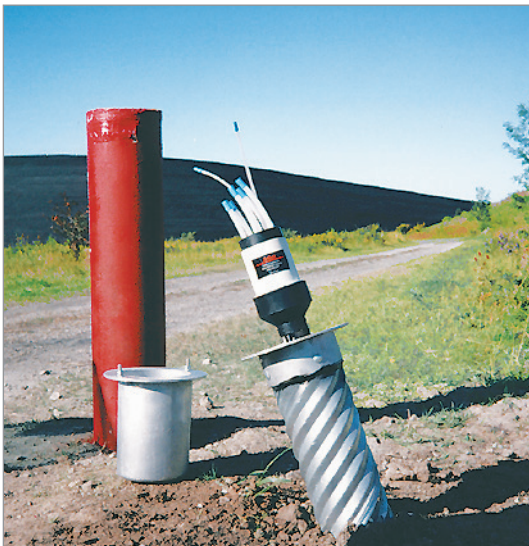
An investigation of hydraulic properties beneath a large waste site. Waterloo Multilevel Systems were chosen to allow water quality sampling and to help determine the zones of highest permeability within the aquifer.