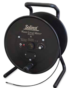
Model 102 P4 Water Level Meter

Sampling may be performed in open tubes using a Mini Inertial Pump, Micro Double Valve Pump, or a Peristaltic Pump.