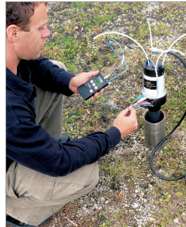
Collecting a sample from a dedicated DVP and taking pressure measurements with Model 404 Geokon Vibrating Wire Readout (above).

Pump control units are simple to use. They have quick-connect couplings with only a single connection to the manifold required. Samples from all levels are easily and rapidly obtained. Purging from some or all levels simultaneously is accommodated by the multi-purge feature of the manifold.