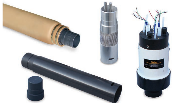
Standard Waterloo System components, including Packer, Port (Dual Stem), PVC Casing, PVC Base Plug, and Manifold.

Monitoring tubes attached to the stem of each port individually connect that monitoring zone to the surface. The standard system is built on 2" (50 mm) Sch. 80 PVC to fit 3"- 4" (75 - 100 mm) boreholes and uses 3 ft. (915 mm) long packers. Stainless steel components and PTFE tubing are available.