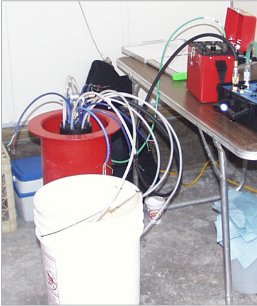
Four Waterloo Systems were installed to monitor a chlorinated compound release. Systems were installed at depths ranging from 430 ft - 750 ft, with most monitoring 7 zones. The Ports were constructed with both Double Valve Pumps and Vibrating Wire Transducers.