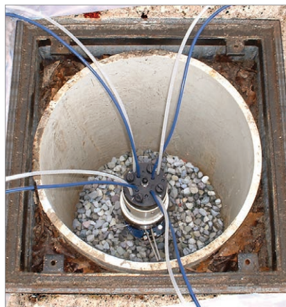
Using core logs to identify placement of Ports and Packers (left). Multi-Purge Manifold with transducers and dedicated pumps for four zone monitoring (right).