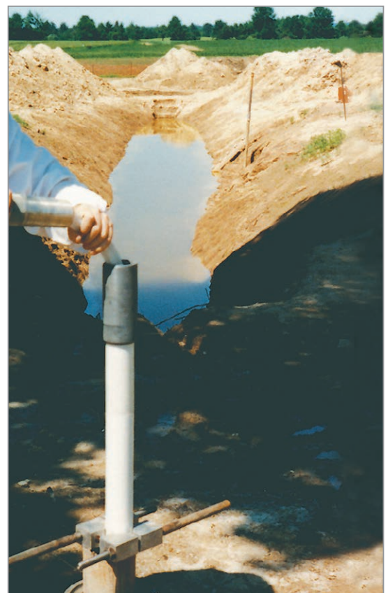
Underground oil pipeline leak assessment. Three 150 ft. (45 m) installations. Two point rising head permeability tests were conducted in each interval of the Multilevel System. (See diagram showing contaminant distribution at left.)