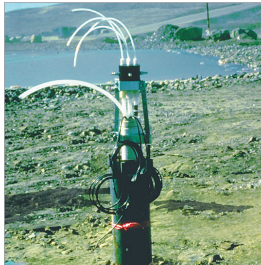
Landfill site over fractured granite, monitored with five Waterloo Systems. Each System comprised of dedicated Double Valve Pumps and Pressure Transducers in 4-6 intervals to depths of 275 feet (84 m). The Multi-Purge Manifold allowed the monitoring of 21 zones to be completed in less than 2 days.