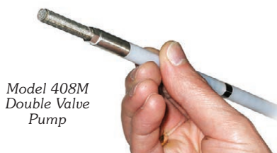
Model 408M Double Valve Pump

Dedicated Bladder and Double Valve Pumps, (DVP), as well as a portable DVP are ideal for use when low flow sampling and purging techniques are desired.