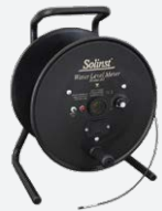
Model 102 Water Level Meter

Vapor Samples: A special Vapor Wellhead Assembly can be used to obtain depth discrete vapor samples.