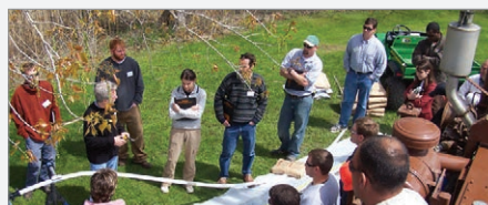
Outdoor installation/ demonstration at premises of Parrat-Wolff, Environmental and Geotechnical Drilling Services, Syracuse, New York.