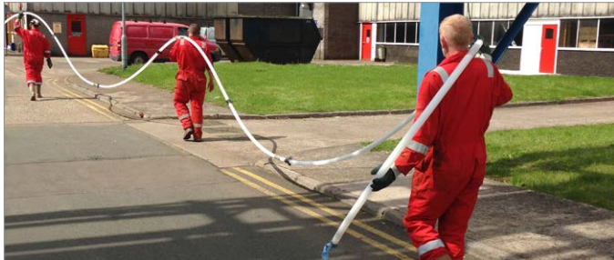
Nineteen 7-Channel CMT Systems were installed inside a manufacturing facility to characterize and monitor a plume beneath the building that is migrating off site. Systems were installed using sonic drilling to 30 m depths. Challenging geology made drilling and installation tricky, however, all Systems were installed in two weeks.