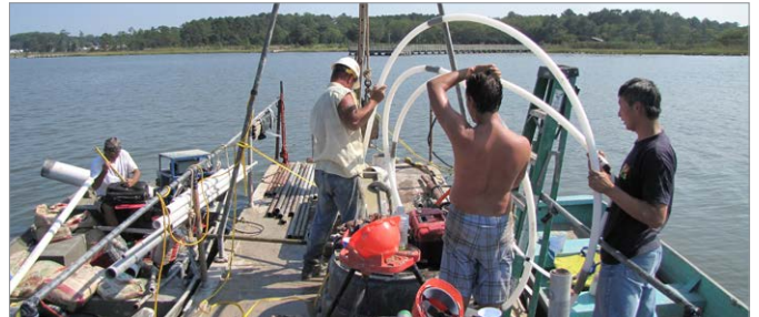
CMT Systems were installed at the bottom of a bay to measure submarine groundwater discharge. Eight 7-Channel CMT Systems were installed, with custom modifications to suit the open water application. Watertight wellheads had to be custom built to allow for sampling from the surface of the bay using a peristaltic pump.