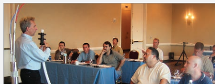
Instructing drilling contractors and consultants on CMT installation techniques at Battelle Bio-Symposium, Baltimore, Maryland.