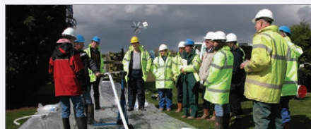
CMT Installation and training as part of a “Multilevel Course” given by the University of Cranfield at Silsoe, U.K., in conjunction with Waterra (UK), British Geological Survey & Norwest Holst.

Please contact Solinst should you wish to attend or set up a training session.