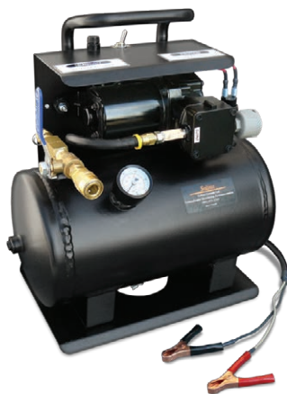
12 Volt Compressor

The compressor operates using 12 volt DC power source, such as a car or truck vehicle battery, and comes with alligator clips. The compressor operates at up to 125 psi and is equipped with a 2 US gallon (7.6 L) air tank which is rated to 150 psi.