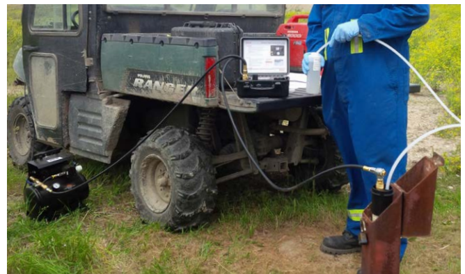
Sampling with a Dedicated Bladder Pump using Portable, Rugged, Easy-to-use, Compressor and Controller

For water level monitoring there is an access hole to fit a Solinst Model 101 Water Level Meter or Levelogger. An eyebolt is provided for a pump support cable or for suspension of a Solinst Levelogger, (see Model 3001 Data Sheet) or other device.