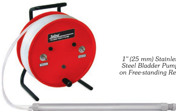
1" (25 mm) Stainless Steel Bladder Pump on Free-standing Reel

They are supplied on a free-standing reel. The rugged systems are very convenient and easy to transport. Tubing fittings on the reels and controller are compression fittings, allowing quick set up in the field. The Solinst Model 103 Tag Line can be used to lower and support the pump in the well (see Model 103 Data Sheet).