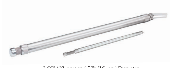
1.66" (42 mm) and 5/8" (16 mm) Diameter Stainless Steel Double Valve Pumps

The DVP is suitable for low flow or regular flow sampling. The stainless steel pumps can operate to depths of 500 ft (150 m).