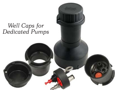
Well Caps for Dedicated Pumps