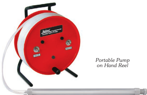
Portable Pump on Hand Reel

For less frequent sampling, reel mounted portable systems allow access to multiple monitoring wells, even in remote locations. The reel mounted portable units are free-standing with a convenient carrying handle. They can be made for almost any size or depth of application.