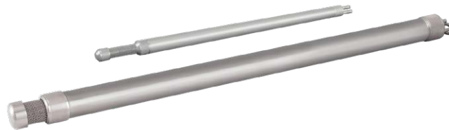
1.66" (42 mm) and 5/8" (16 mm) Diameter Stainless Steel Double Valve Pumps

The DVP is suitable for low flow or regular flow sampling. The stainless steel pumps can operate to depths of 150 m (500 ft).