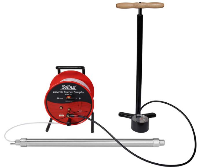
1.66"ø Discrete Interval Sampler with High Pressure Hand Pump

Biodegradable disposable PVC bailers and stainless steel Point Source Bailers are also available from Solinst (see Model 428 BioBailer & 429 Point Source Bailer Data Sheets).