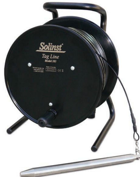
Tag Line / Suspension Cable