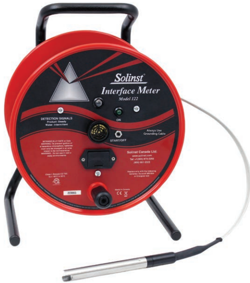
Oil/Water Interface Meter