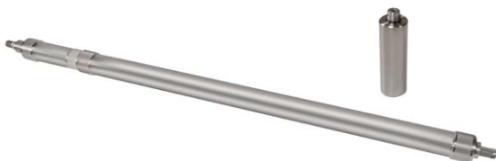
425-D Deep Sampling Discrete Interval Sampler and Weight