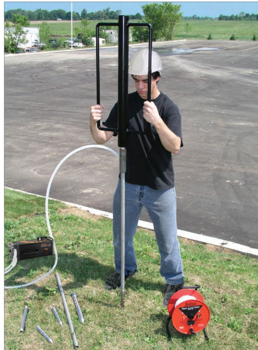
Installing Piezometers with a Manual Slide Hammer

Solinst Drive-Point Piezometers can be driven into the ground with any direct push or drilling technology, including the Manual Slide Hammer shown at right. To avoid clogging or smearing of the screen during installation, a shielded version is also available.