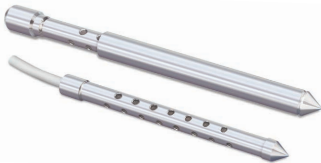
Model 615 Drive-Point and Shielded Drive-Point Piezometer