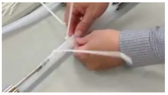
Keep tubing from twisting before adding extension.

15. Once the extension and cable ties reach the port stem, cut the ties from around the tubing and connect the extension to the port.