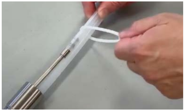
Use cable ties to bundle the tubing.