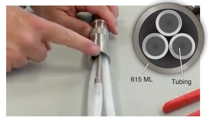
Create a triangle formation with the tubing.

17. Before connecting the third port, pay close attention to where the port stem is. Ideally, when installing 3 tubes, you'd like to create an evenly spaced triangle formation with the three tubes/port stems (similarly, create an evenly spaced formation if using more than three ports with 1/4" tubing).