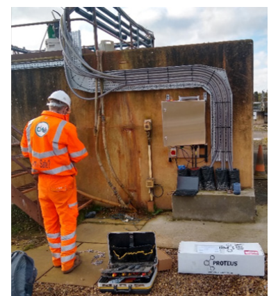
Right: An example from Severn Trent Water of a Proteus being installed into their existing telemetry system, to provide real-time BOD at one of their WWTWs.