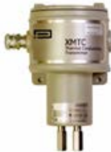
XMTC thermal conductivity gas transmitter