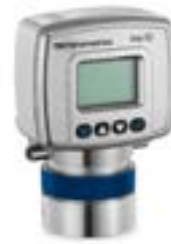
O2X1 galvanic fuel cell oxygen transmitter