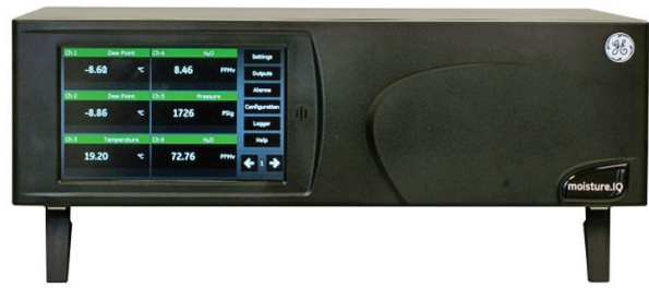
Bench Mount Version

The moisture.IQ can accept inputs from the Panametrics MIS probes and the M Series probes that were available for the Moisture Image Series 1 and Moisture Monitor Series 3 analyzers. The MIS probes (MISP and MISP2) provide integral moisture, temperature, and pressure inputs. The calibration data for these sensors is stored digitally. Upon connection to the analyzer, the calibration data is downloaded to the moisture.IQ.