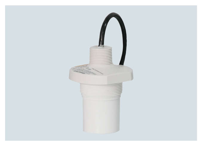
ST-H transducers use ultrasonic technology to measure level in chemical storage and liquid tanks.